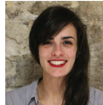
★ MARINE Teacher