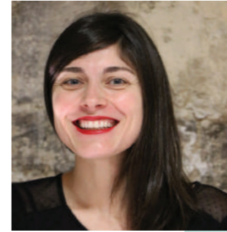
★ ÉLISA Director of Studies